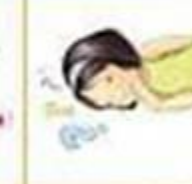
N New Pose