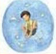
H Happy Baby