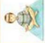
E Easy Pose