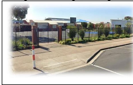
Gate#1: Matlock Street

Students may enter and exit through any gate (Gate #1, Gate #3, Gate #4) that suits their family's arrangements, e.g. walking to school, riding a bike, parking the car and walking, travelling by bus.