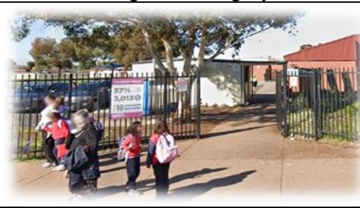
Gate#4: Rewards Shop (Bellbridge Dr)

Staff will be supervising each entry/exit gate to promote a safe and orderly process, and we request that everyone be patient and respectful as we work through this 'new' stage.